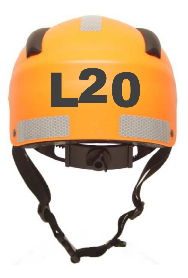
Letters or Numbers